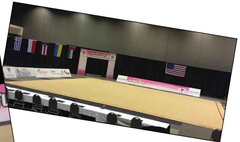
Official AAI Rhythmic Gymnastics Competition Carpet

3 warm-up carpets Over 35 ft. ceiling height