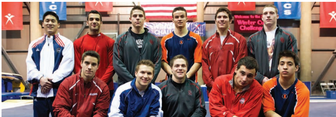
Back Row L to R: Kevin Tan, Danell Leyva, Chris Brooks, Paul Ruggeri III, Alexander Naddour, Steven Legendre. Front Row L to R: Jake Dalton, Jonathan Horton, Tim Gentry, Brandon Wynn, Tyler Mizoguchi

Chris Brooks of the University of Oklahoma won the all-around title at the 2010 Winter Cup Challenge at the Las Vegas (Nev.) Sports Center, Feb. 7. The all-around and individual event champions were determined with a combined two-day score. In addition, 17 men were named to the U.S. Senior National Team.