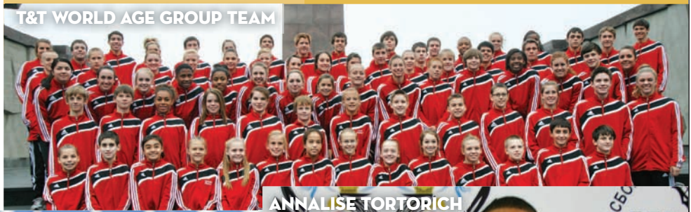
T&T WORLD AGE GROUP TEAM