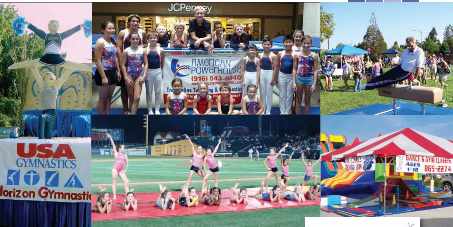
Pictured above L clockwise: Horizon Gymnastics, American Powerhouse TNT, California Sports Center, Patti's All-American and St.Mary's Rec. and Parks Gymnastics