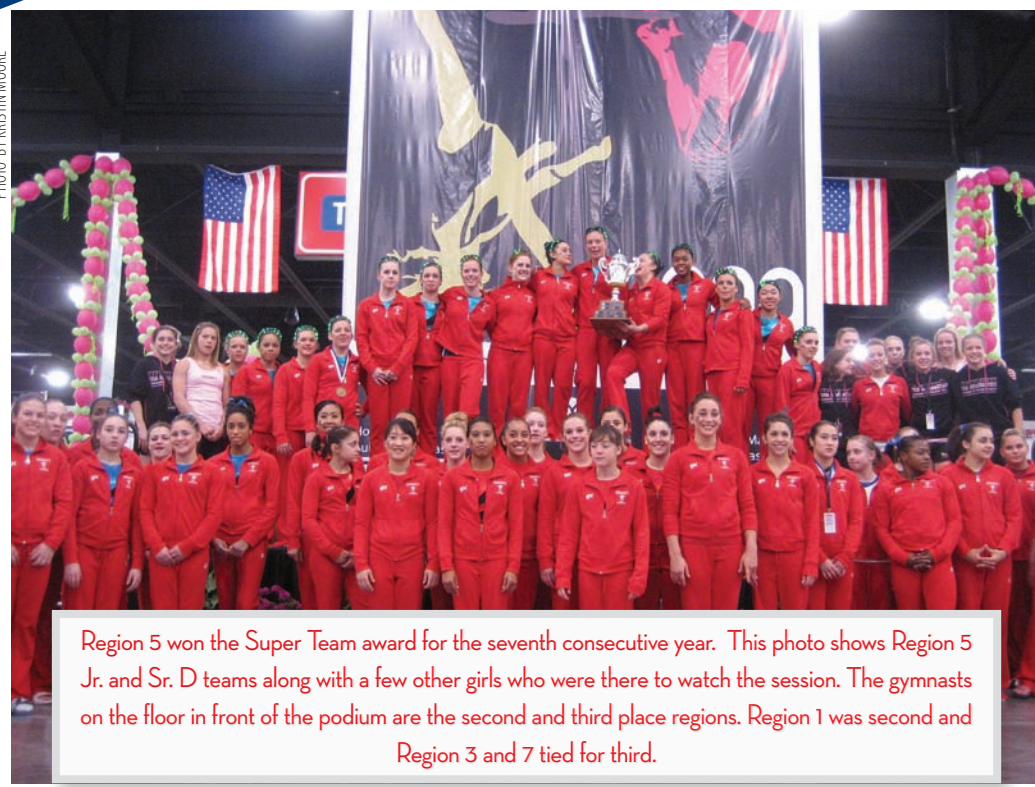
Region 5 won the Super Team award for the seventh consecutive year. This photo shows Region 5 Jr. and Sr. D teams along with a few other girls who were there to watch the session. The gymnasts on the floor in front of the podium are the second and third place regions. Region 1 was second and Region 3 and 7 tied for third.