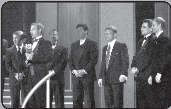
The 1984 Men's Team was honored at the ceremony.

"This was an incredible experience. It was great for our team to be recognized again. We are just a great big family, and for us to get together again and be recognized in this way is awesome."