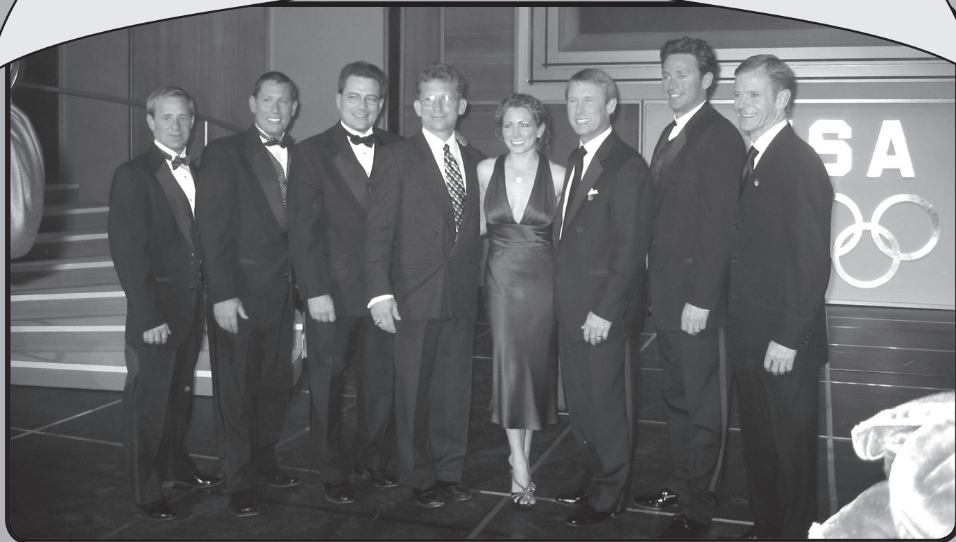
L to R: Scott Johnson, Tim Daggett, Jim Mikus, Jim Hartung, Shannon Miller, Bart Conner, Mitch Gaylord, and Peter Vidmar.

S hannon Miller, who has won more Olympic and world medals than any other U.S. gymnast, and the 1984 Men's Gymnastics Team that earned the USA's first Olympic team gold medal were inducted into the U.S. Olympic Hall of Fame Presented by Allstate Dec. 9, in Chicago, Ill.